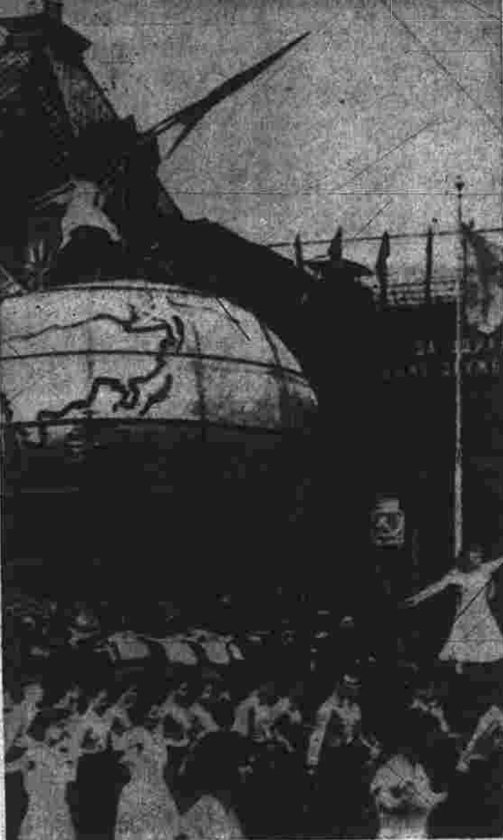
Buenos Aires, May 1 (P) Arturo Frondisi was sworn in today as president of Argentina's first democratic government in mega. Sputnik conscious group in Mascow's May Day parade displays float representing Earth surmounted by rocket taking off into space. Kremlin is in background.